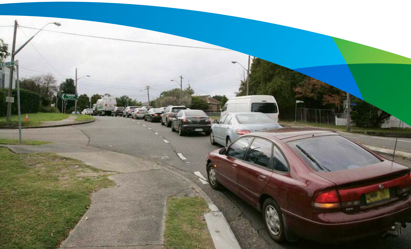
Intersection of Blaxland Road and First Avenue