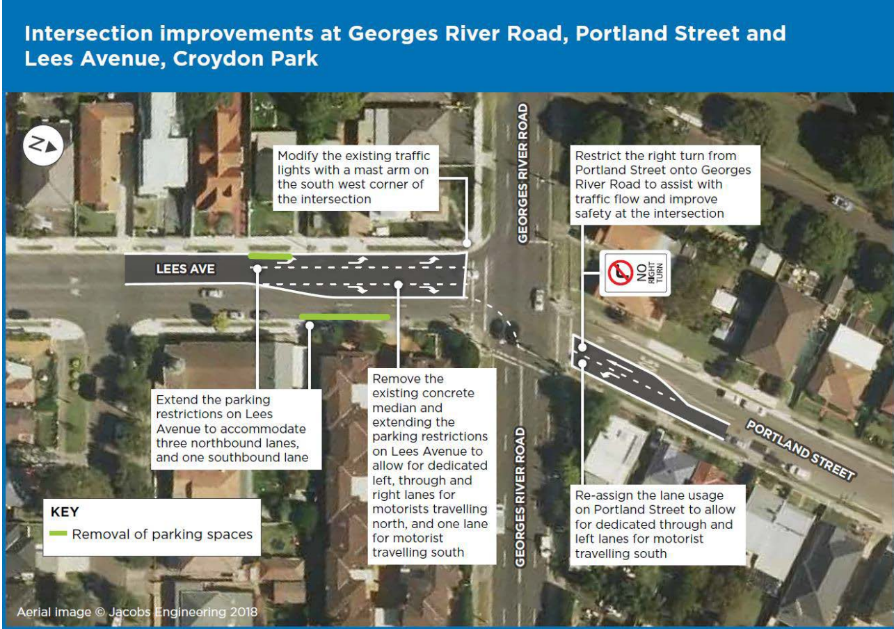
Figure 1: Proposed intersection improvements at Georges River Road, Portland Street and Lees Avenue, Croydon Park

We have included a map to explain the proposal.