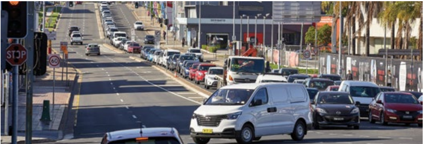
The intersection upgrade will ease congestion on Church Street, approaching the Parramatta CBD

In March 2020 , Transport for NSW will start work to upgrade the intersection of Church Street, Parkes Street and Great Western Highway, one of the busiest road hubs in Parramatta's growing CBD.