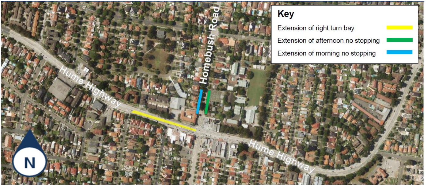
Figure 1 – Original proposed improvements on the Hume Highway and Homebush Road, Strathfield