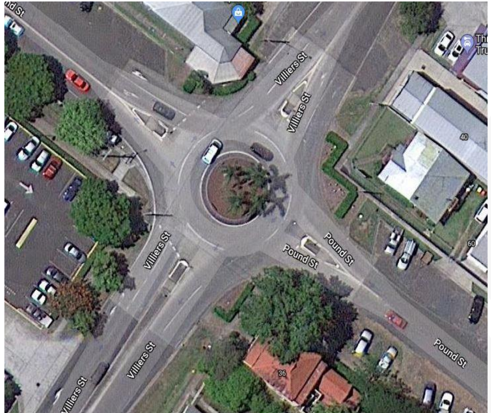
Aerial view of the Villiers Street roundabout