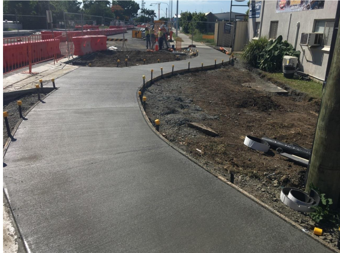
Footpath completed beside Jada Hair Salon (December 2018)