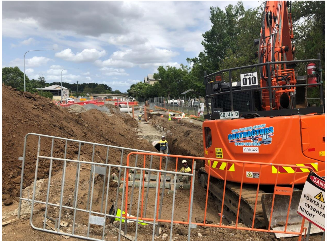
Water main work underway on Pound Street adjacent to the TAFE (February 2019)