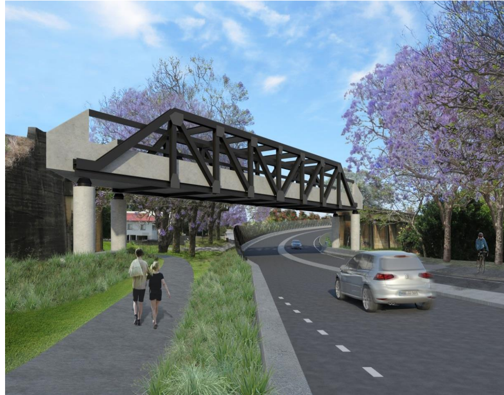
Artist's impression of the new Pound Street rail bridge