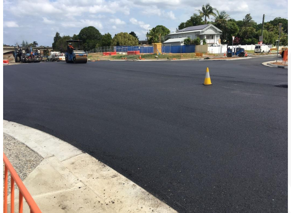
Asphaltting of the intersection of Pound and Clarence streets underway (January 2019)