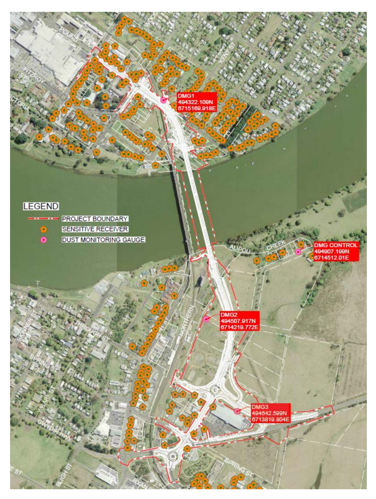
Figure A-1 Map showing indicative locations of dust monitoring gauges