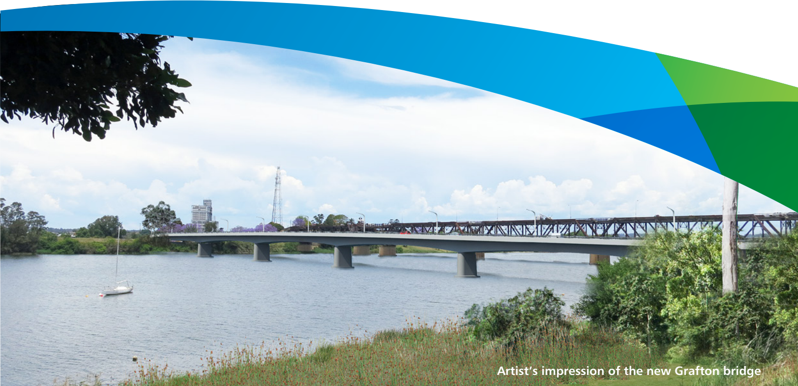
Artist's impression of the new Grafton bridge