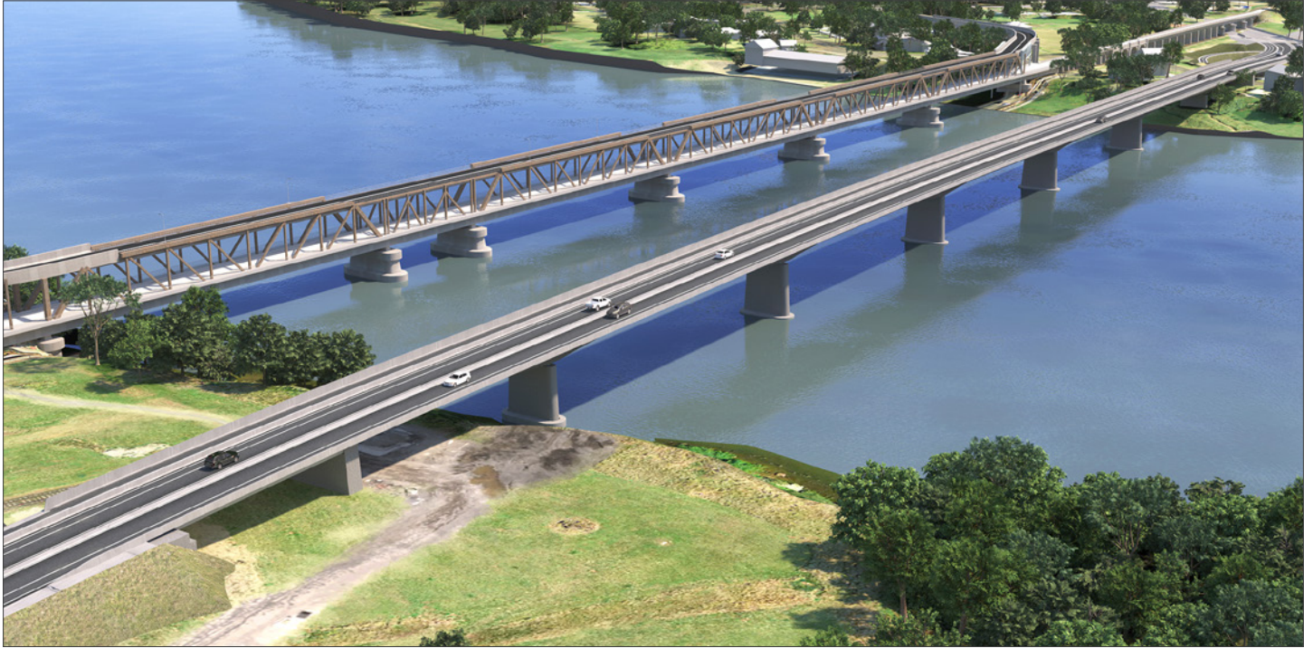
Artist's impression of the new Grafton bridge alongside the existing bridge