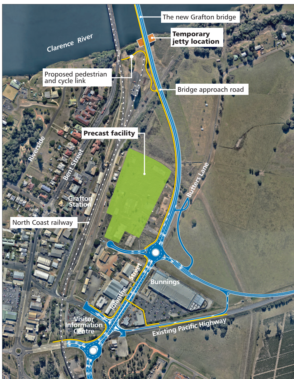
Location of temporary jetty and precast facility

From early April, building will start on a precast concrete facility in the industrial area at 21 Through Street, South Grafton. This facility will make concrete segments which will be used to construct the new bridge. The facility will include two beam segment moulds, cranes, storage areas, light towers, staff amenities and light vehicle parking. It is expected to be required for about 18 months and will be decommissioned when casting work is completed.