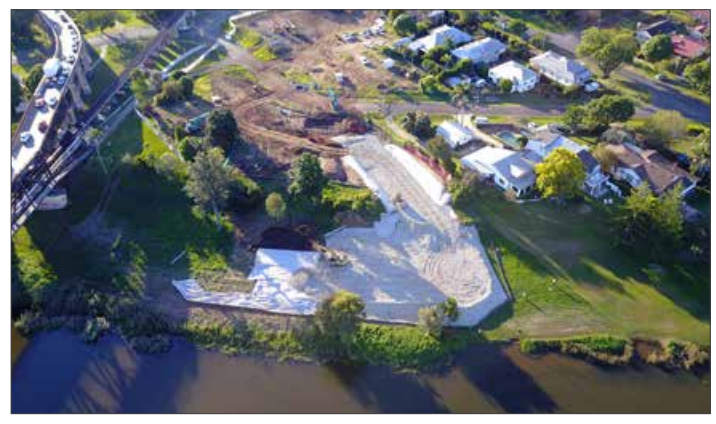
Crane pad earthworks on the north side of Clarence River

Any work outside of these hours will be carried out in accordance with the project's Conditions of Approval. Nearby residents will always be notified of any proposed work outside of these hours.