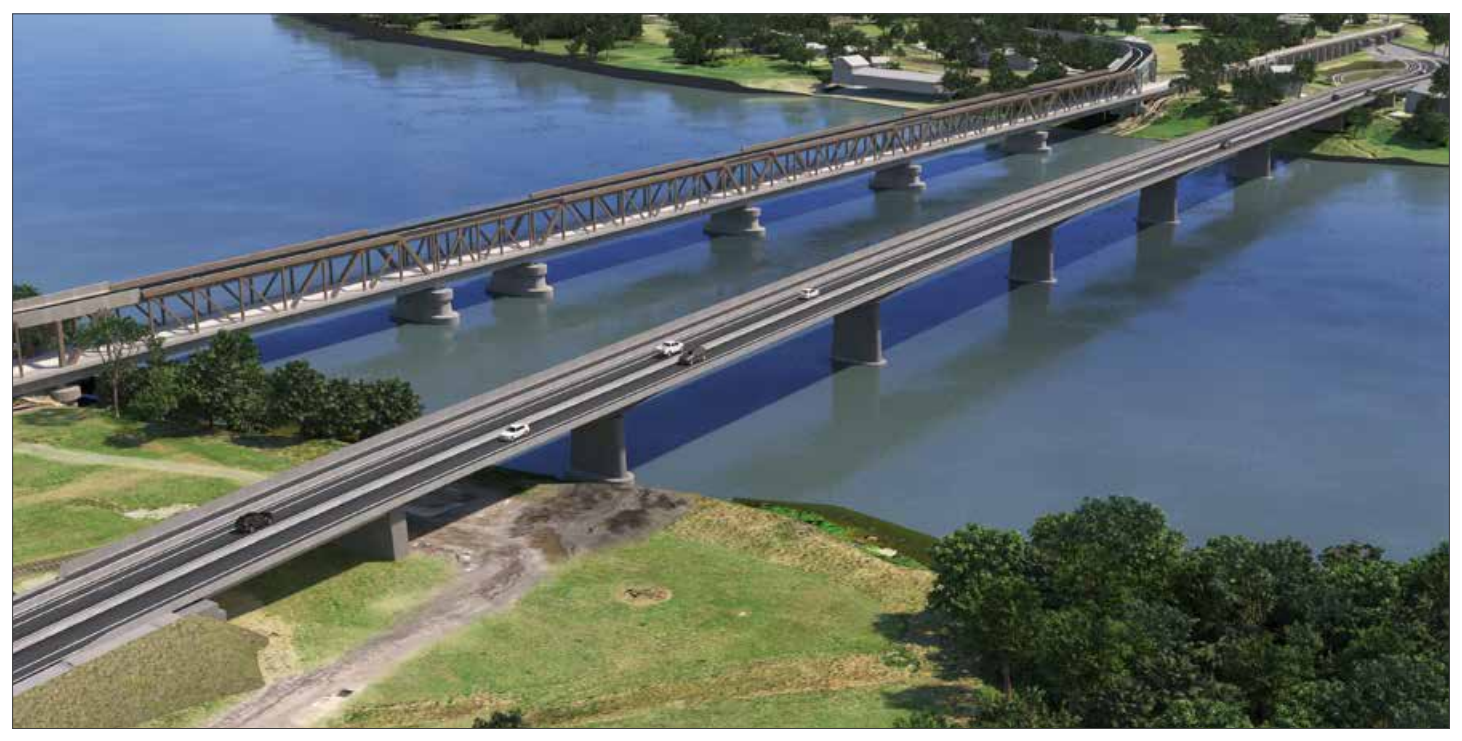
Artist's impression of the new Grafton bridge alongside the existing bridge