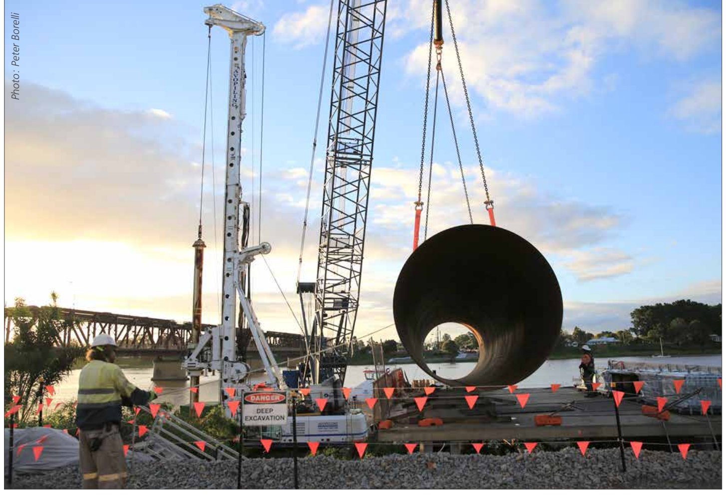
A steel casing for a marine pile being lifted by the crane on the southern embankment