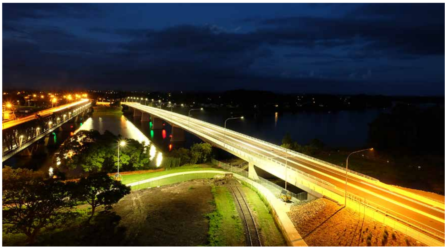
View looking north of the new Grafton bridge at night

Line-marking changes have also been implemented at the Charles and Bent streets roundabout in South Grafton. Westbound motorists in Charles Street are no longer permitted to turn right from the left lane at the Bent Street roundabout.