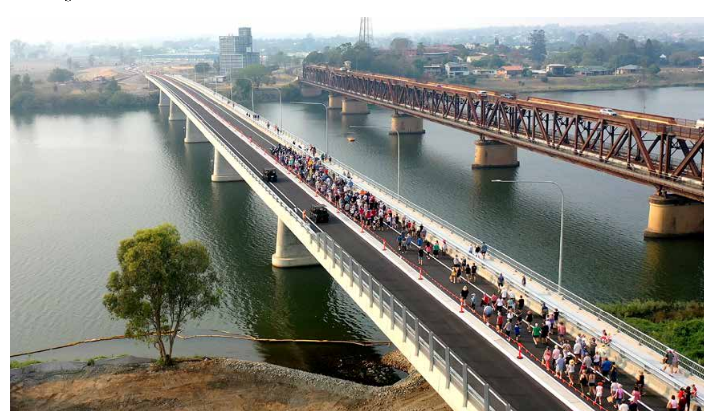
Aerial view of community members walking across the bridge on 8 December

The traffic switch moved the intersection slightly closer to the former visitor information centre to allow construction of the roundabout to continue near the vacant service station. The intersection will continue to operate as a T-intersection until the new roundabout pavement work is complete.