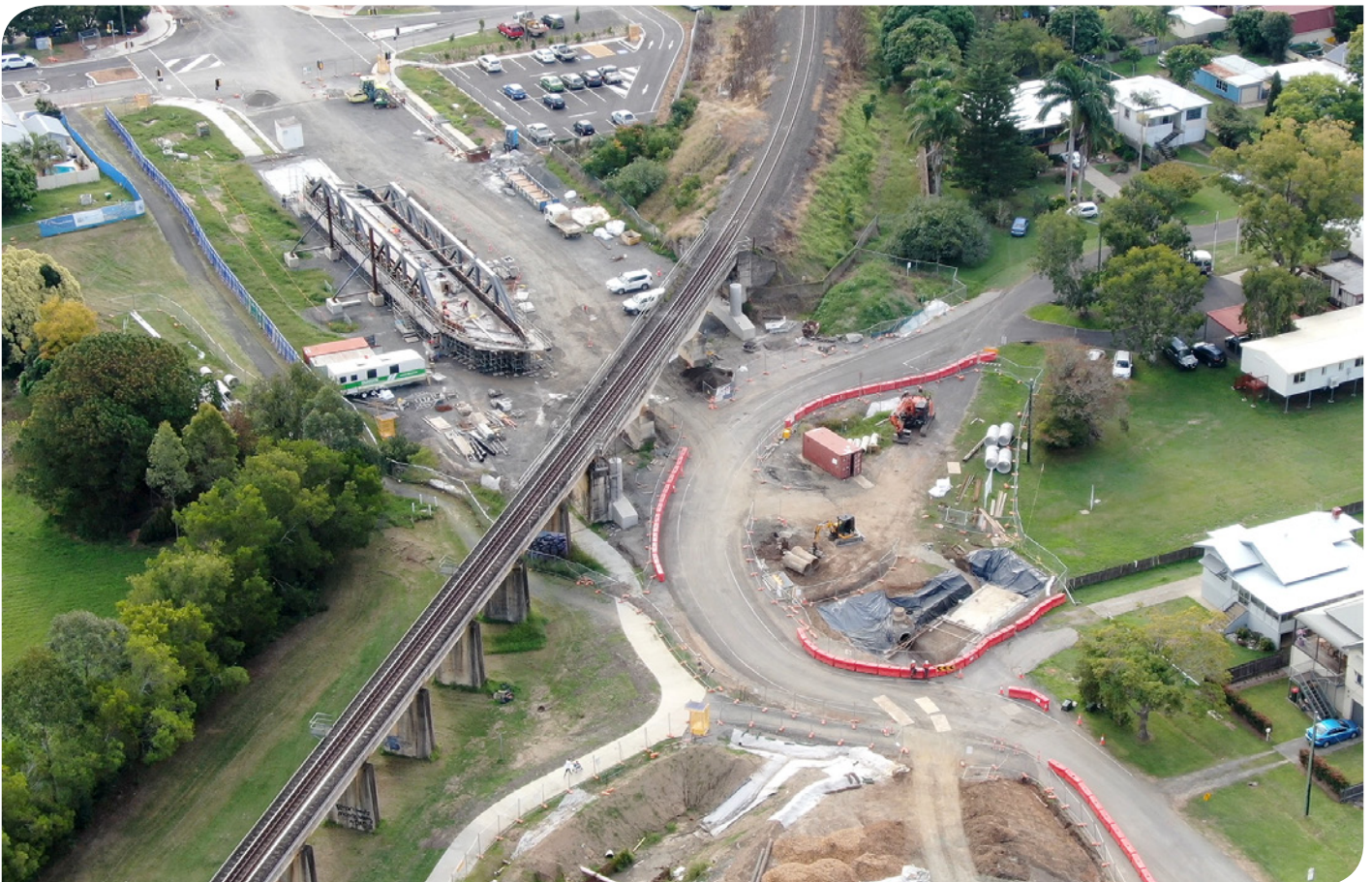
The new Pound Street rail bridge work site