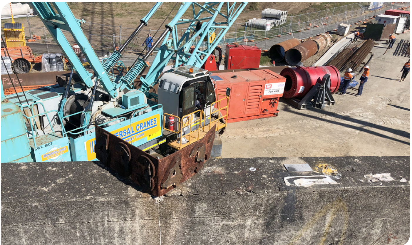
The historical mile marker on existing Pound Street bridge

After the June long weekend, the 750-tonne crane used to lift the new Pound Street rail bridge into place will be moved to the northern bank to start lifting the remaining segments into place.