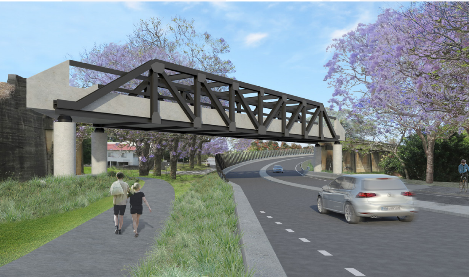
Artist's impression of the new Pound Street rail bridge

The new Grafton Bridge will transform the entry to the riverside city and change the way motorists, pedestrians and cyclists move around. This update outlines progress being made on the $240 million NSW Government project and upcoming work.