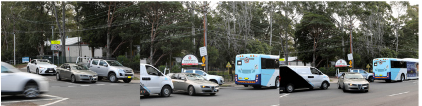
Pacific Highway at Finlay Road: the upgrade will improve safety at this intersection by banning unsafe right turns.