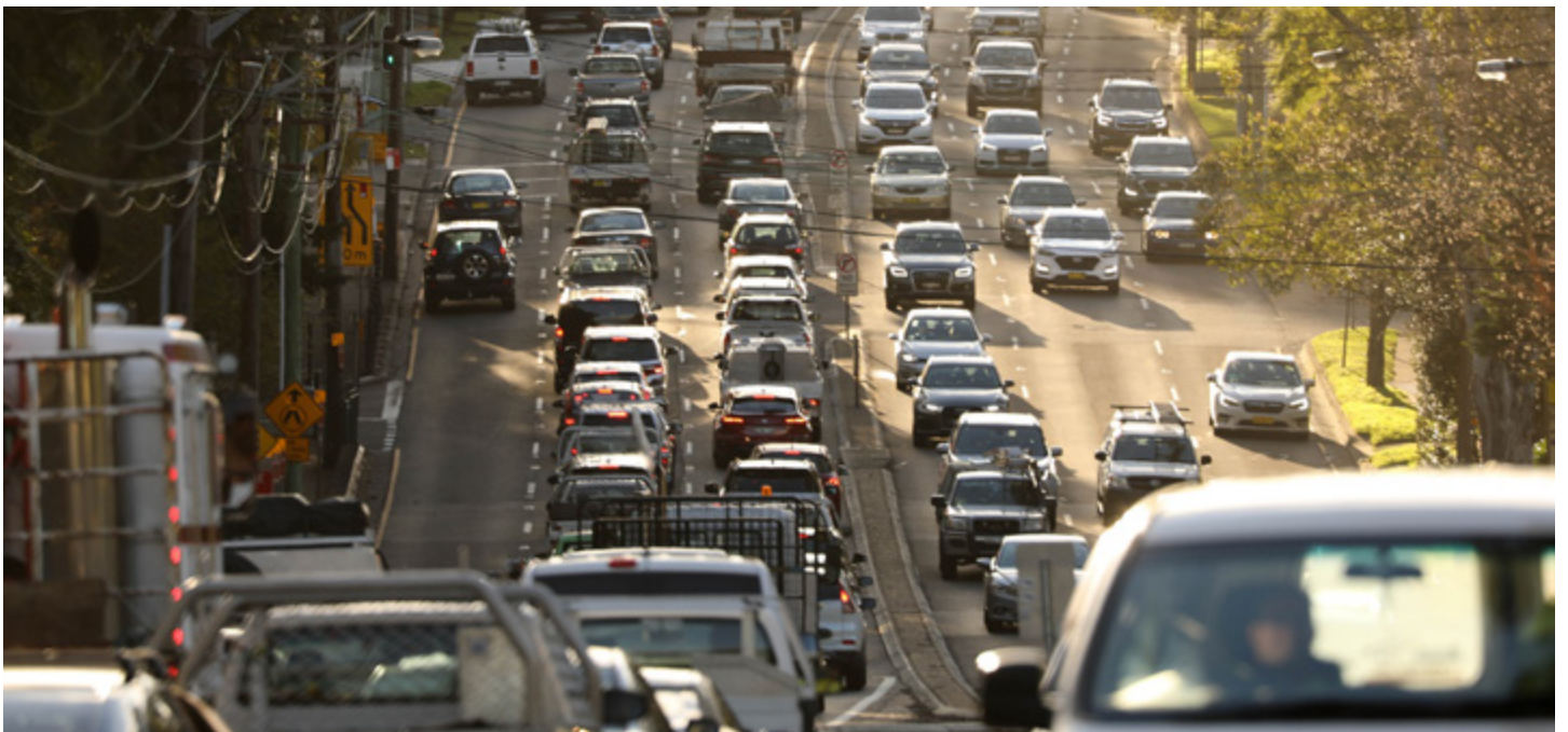
Pacific Highway at Fox Valley Road: the upgrade will reduce congestion at this intersection.

You can find out more about the Wahroonga Station Upgrade at www.transport.nsw.gov.au/wahroonga