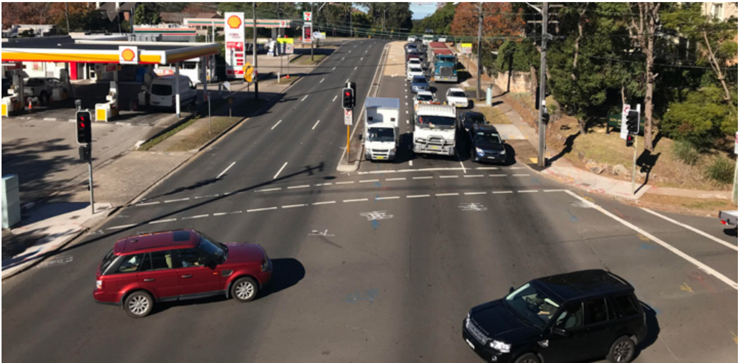
Pacific Highway at Coonanbarra Road: the upgrade will ease congestion at this intersection.

In October 2020, work will start to upgrade intersections along the Pacific Highway between Turramurra and Wahroonga. The NSW Government is funding improvements at intersections on the Pacific Highway at Fox Valley Road, Redleaf Avenue and Coonanbarra Road. The Australian Government and NSW Government are jointly funding upgrades at the Pacific Highway and Finlay Road.