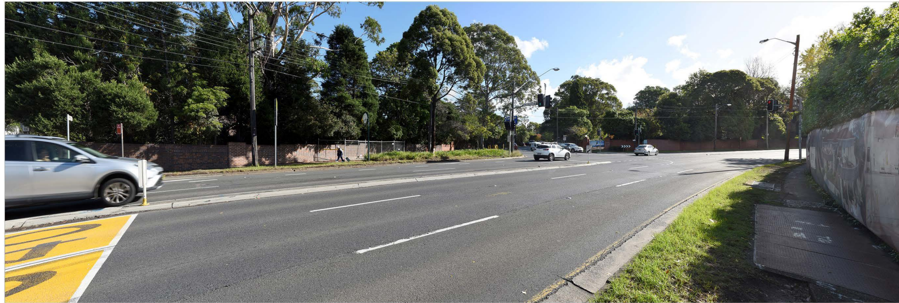
Existing – South of Fox Valley Road on approach to the intersection towards “Mahratta” / School of Practical Philosophy - Wahroonga (looking north west)