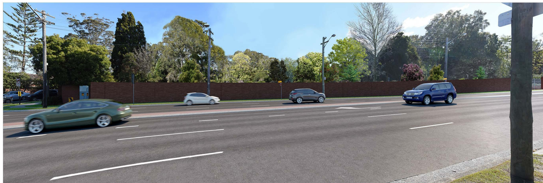
Visualisation of Proposal (Established Vegetation) - North of Fox Valley Road intersection opposite “Mahratta” / School of Practical Philosophy - Wahroonga (looking north west)

*Proposed roadside planting indicative only and subject to future consultation with property owners