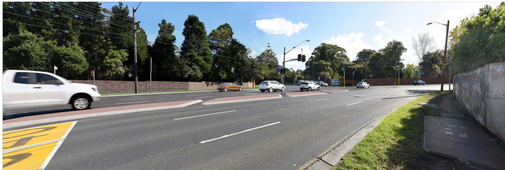
Visualisation of Proposal (Established Vegetation) - South of Fox Valley Road on approach to the intersection towards “Mahratta” / School of Practical Philosophy - Wahroonga (looking north west)

*Proposed roadside planting indicative only and subject to future consultation with property owners