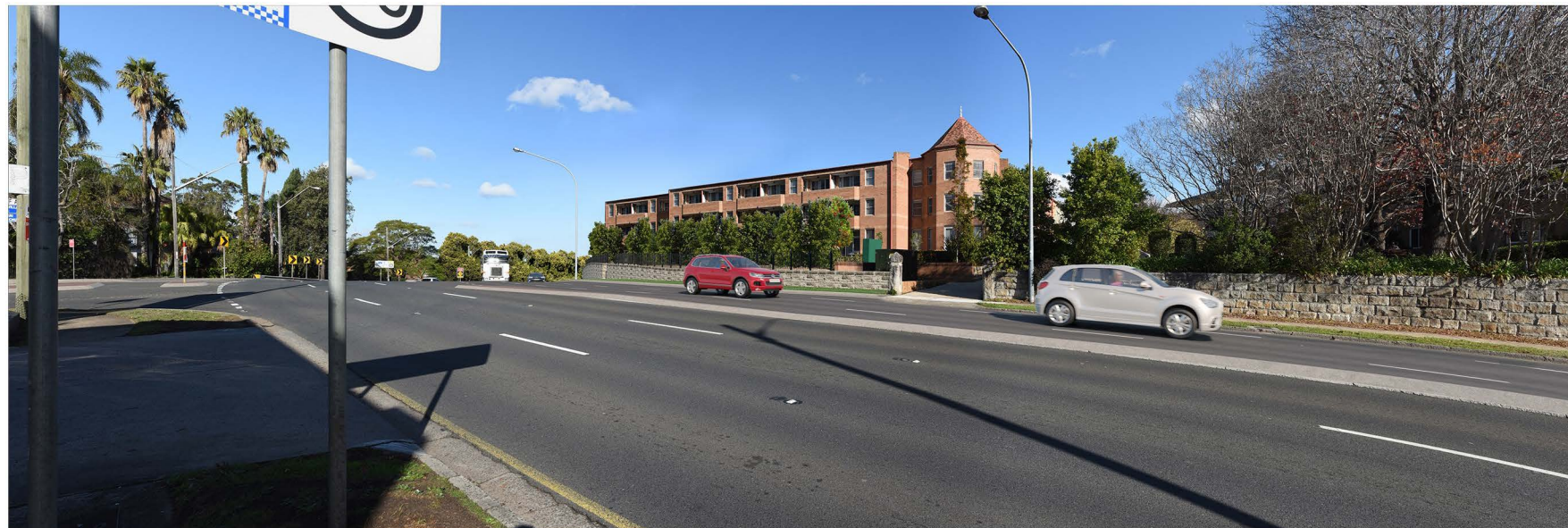
Visualisation of Proposal (Established Vegetation) - Between Coonanbarra Road and Redleaf Avenue intersections opposite "Estha Gates"/ Thomas and Rosetta Agst Aged Care Facility (looking south east)

*Proposed roadside planting indicative only and subject to future consultation with property owners