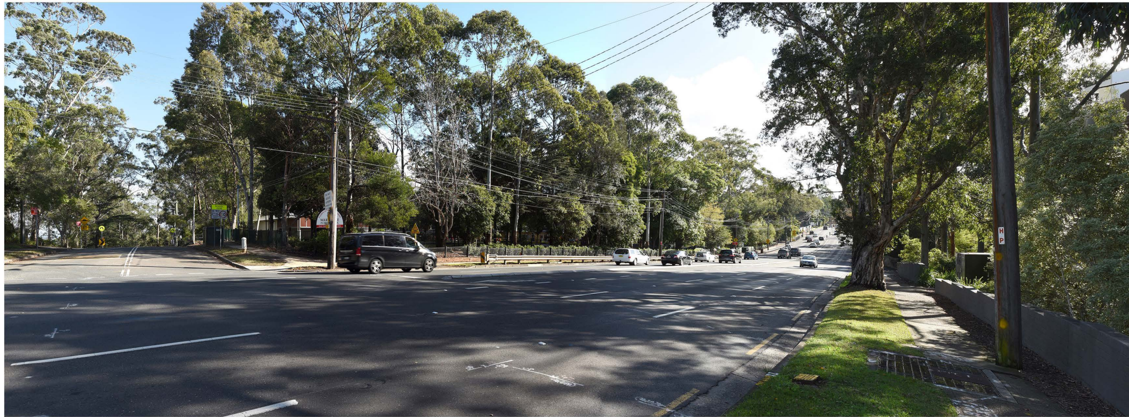
Existing – Opposite Finlay Road near Warrawee Public School (looking north west)