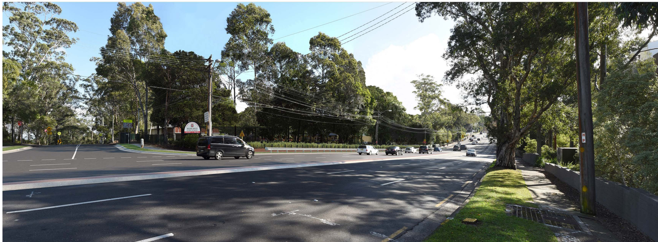
Visualisation of Proposal (Just After Construction and Established Vegetation) – Opposite Finlay Road near Warrawee Public School (looking north west)

*Proposed roadside planting indicative only and subject to future consultation with property owners