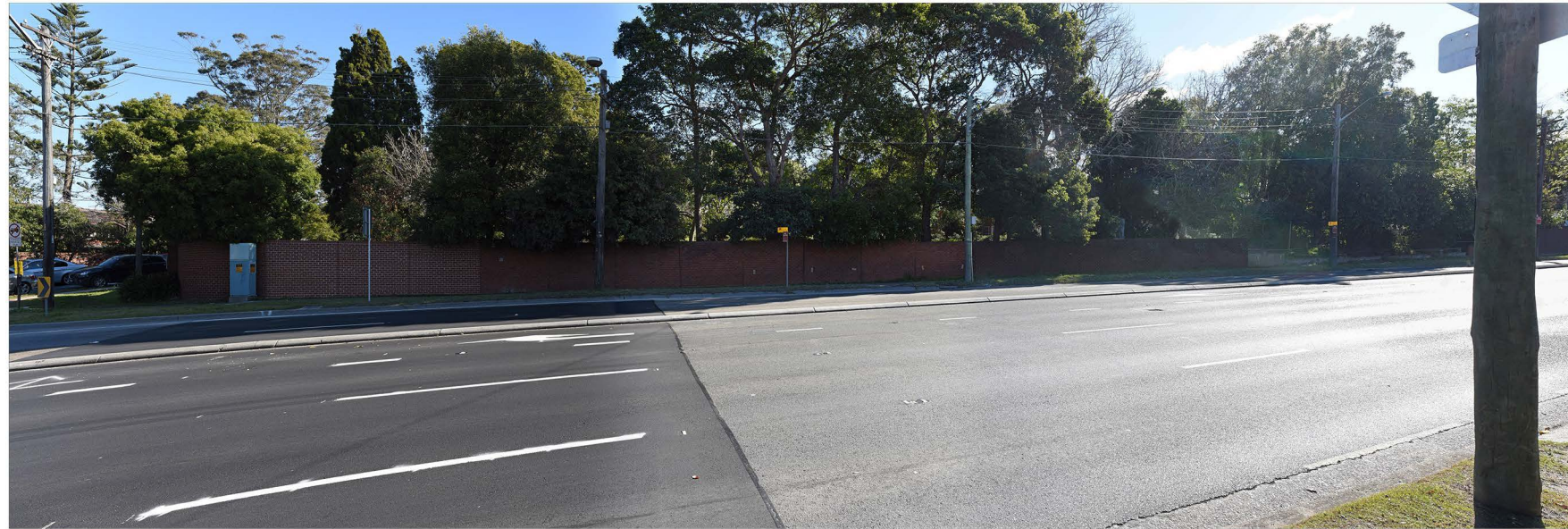
Existing – North of Fox Valley Road intersection opposite “Mahratta” / School of Practical Philosophy - Wahroonga (looking north west)