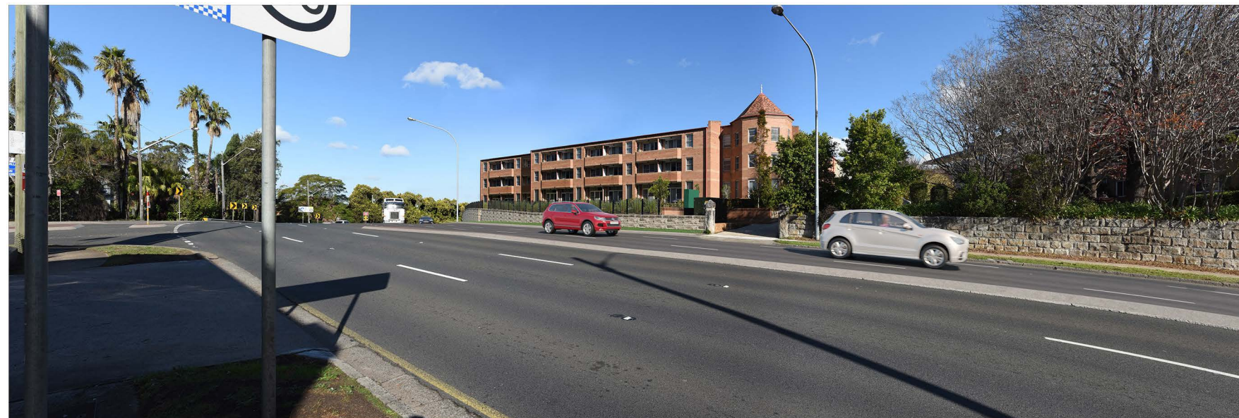
Visualisation of Proposal (Just After Construction) - Between Coonanbarra Road and Redleaf Avenue intersections opposite "Estha Gates"/ Thomas and Rosetta Agst Aged Care Facility (looking south east)

*Proposed roadside planting indicative only and subject to future consultation with property owners