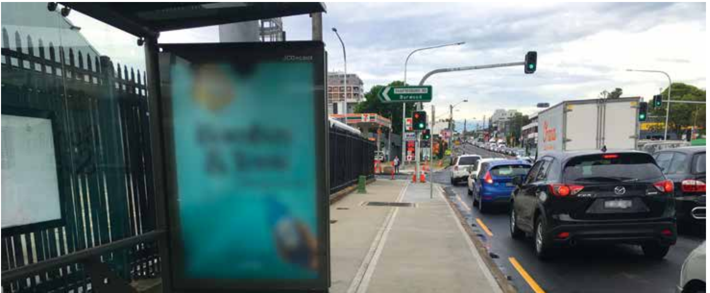
The newly completed footpath on Parramatta Road outside Burwood Bus Depot