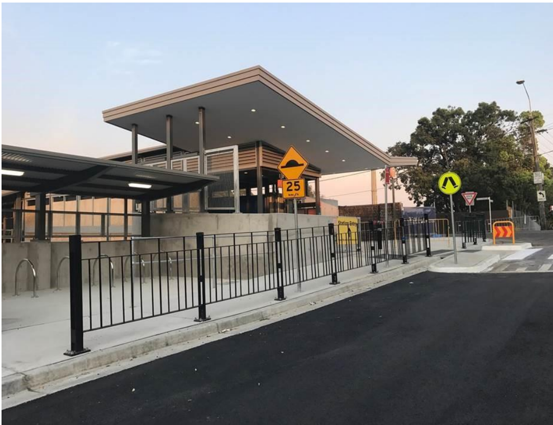
View of the Hennessy Street entrance – September 2017

As part of the staging works to complete the Croydon Station Upgrade, new station facilities were made available to the public on Sunday 24 September 2017. These included the commissioning of two new lifts and stairs, a new station concourse providing an undercover pedestrian link, a station office, a family accessible toilet, and the new station entrances on Paisley Road/The Strand and Hennessy Street. New Opal card readers are located on the station platforms.