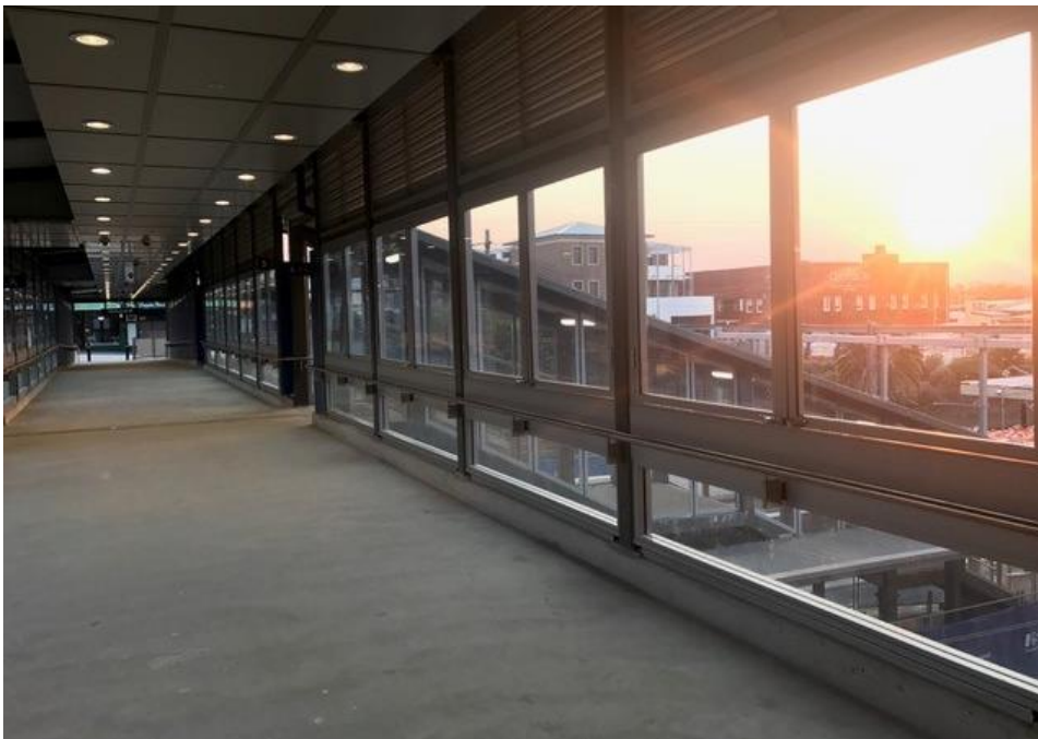
View from inside the new concourse – September 2017

Work will continue during standard construction hours which are Monday to Friday 7am to 6pm and Saturday 8am to 1pm . Additional notification of any works outside of these hours will be provided to the community prior to those works commencing. Every effort will be made to minimise the noise impact on nearby residents and businesses. We apologise for any inconvenience and thank you for your patience during this important work.