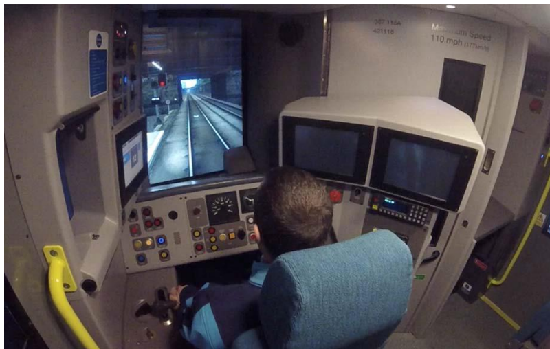
Figure 2c: CCTV Monitors for DOO - Class 379 Driving Cab for DOO

13.5.4 Included in the train design are systems that will improve the safety of station operations and train dispatch compared to the current fleets.