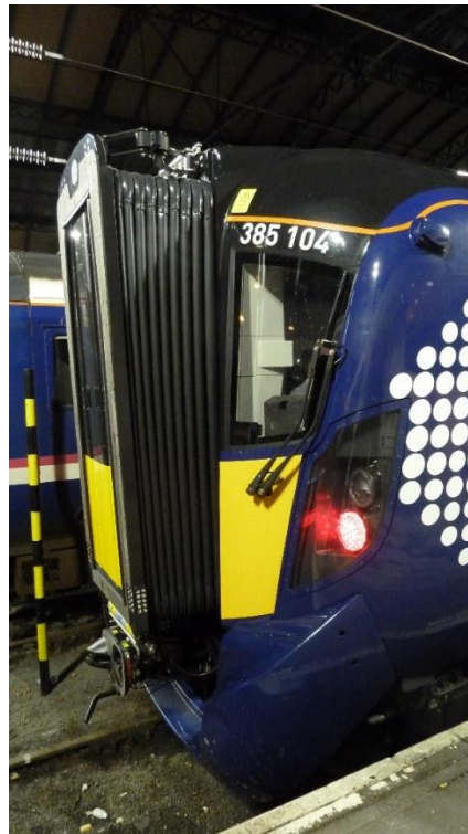
Figure 2a: Windscreen and gangway of a Class 385 Driving Cab used for DOO

13.5.3 A photograph of a comparative UK driving cabs is provided in Figure 2a to 2c. Figure 2a is of the Class 385 EMU, recently built by Hitachi for operation by ScotRail showing the very small windscreen of the driving cab and the passenger gangway. The controls used by the driver on this train are shown in Figure 2b.