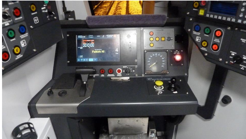
Figure 2b: Drivers desk of a Class 385 Driving Cab used for DOO