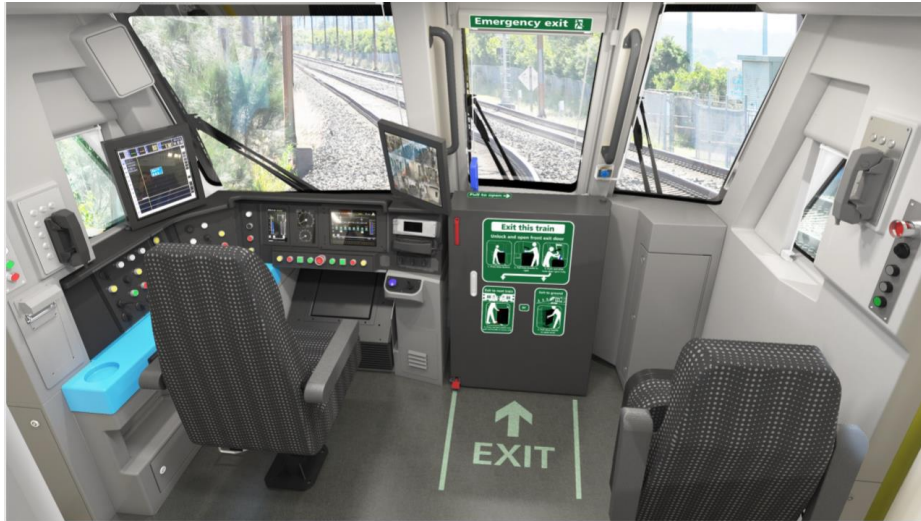
Figure 1: Indicative image of the crew compartment