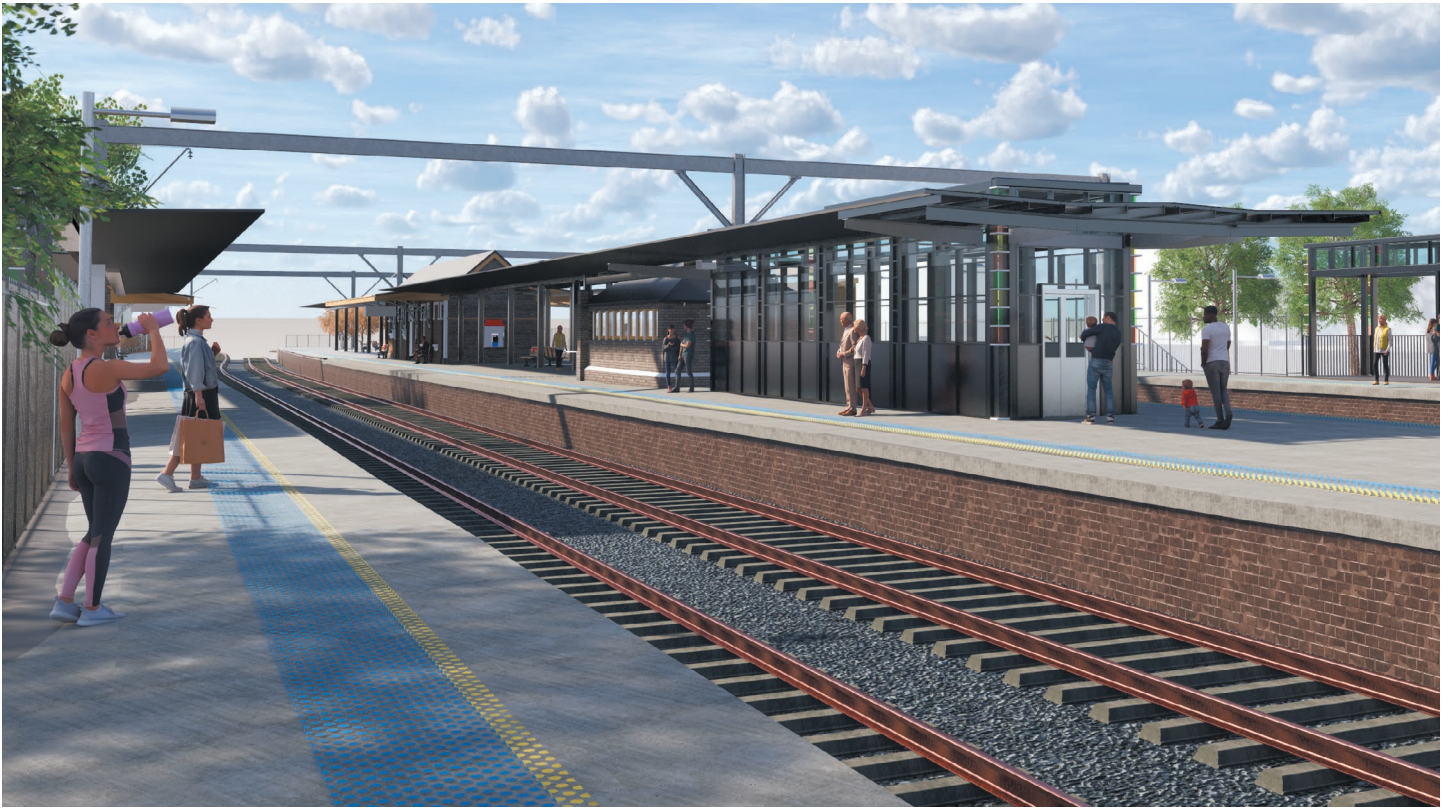
Artist's impression of the proposed Banksia Station Upgrade, subject to change during detailed design