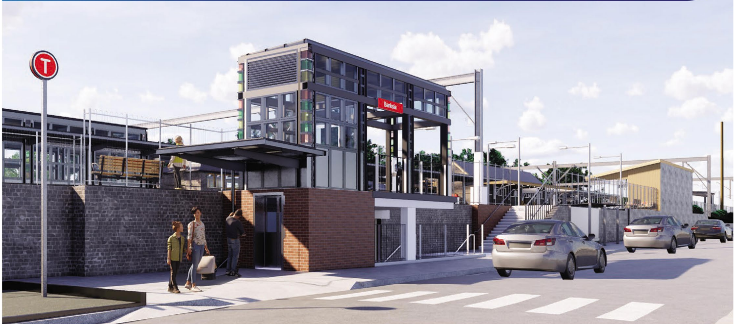
Artist's impression of the proposed Banksia Station Upgrade, subject to change during detailed design