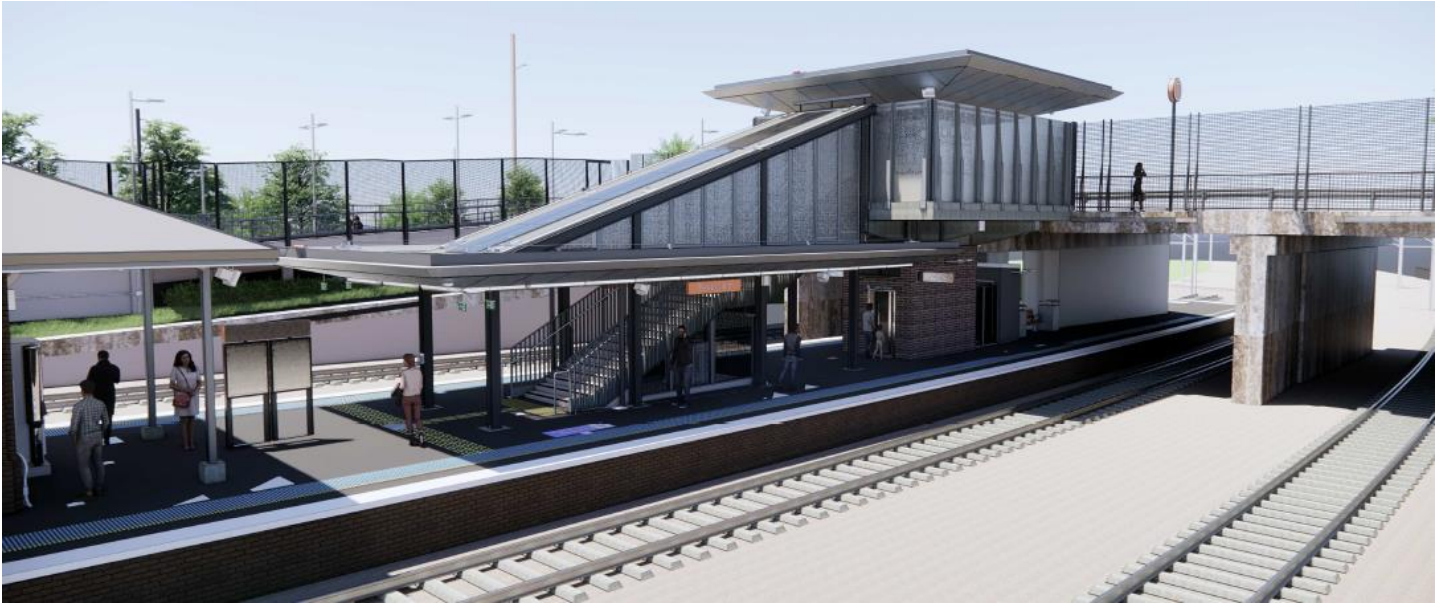
Image: Artist's impression of Bexley North Station Upgrade. Subject to detailed design.