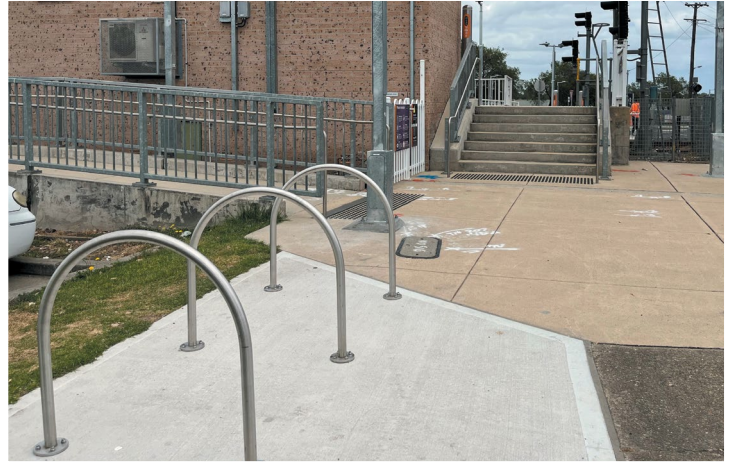
New bicycle hoops at the Platform 1 entry