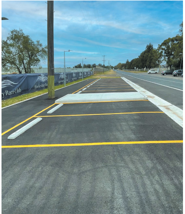
Additional commuter car parking spaces on Racecourse Road

We will keep the community informed about this work as it progresses.