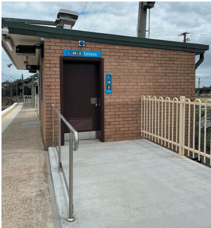
New family accessible toilet