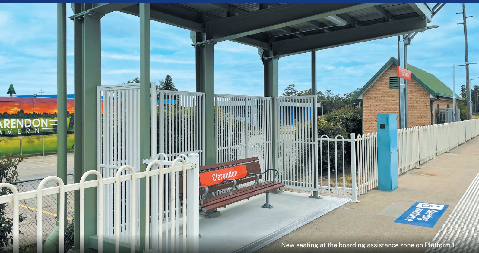
New seating at the boarding assistance zone on Platform 1