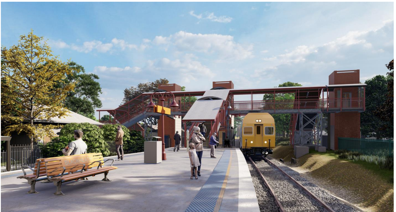
Artist's impression of the approved Blackheath Station Upgrade

The project is expected to be completed in 2023.