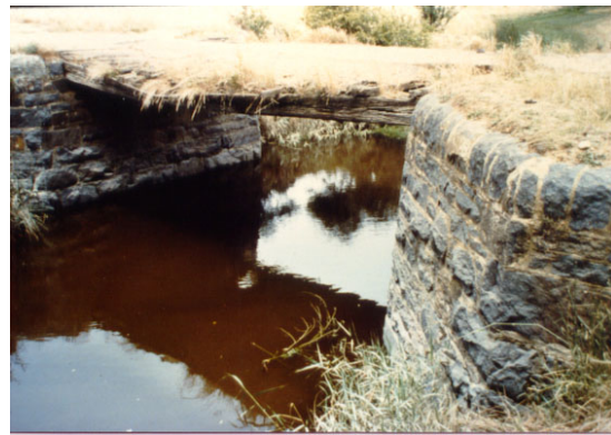
A turf covered beam bridge