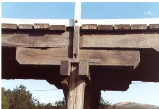
Improved detail at top of trestle