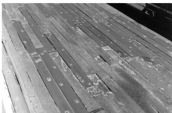
Second layer of longitudinal planks

The differences in details between the pre- and post- 1894 timber beam bridge designs generally assist in identifying the era of a timber beam bridge by site inspection, although two factors can lead to an incorrect decision. Firstly, there was a transition period after 1894 before the wholesale change over to the new design. Consequently, bridges of either type were built during the late 1890s. Secondly, despite the 1894 design becoming the new standard, site visits have revealed many younger timber beam bridges from the 1920s and 1930s, which have old style details such as single member headstocks across the tops of the piles of the trestles. Why the reversion to outmoded practices occurred is not known or recorded.