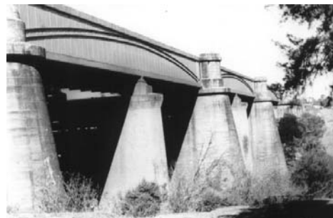
The 1863 Menangle railway bridge, extra piers 1905

The government move was partly effective because Whitton went on to use timber beams, arches, trusses, and some magnificent stone arch viaducts for the railway extensions through the Great Dividing Range. However, for major river crossings he successfully asserted the need for large, high-level iron bridges to stay above maximum flood levels, and