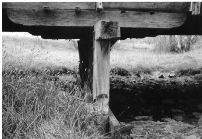
Pre-1894 detail at top of trestle

For a low-level bridge, the cross bracing would be omitted whereas for a high-level bridge there could be two levels of cross-bracing separated by a pair of horizontal wales, one on each side of the piles, and with another pair just above ground level.