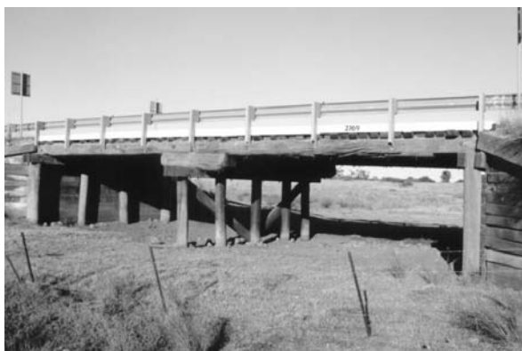
Typical timber beam road bridge, Br No 2769

Timber beam bridges and timber openings, or TOs, as they are called in the railway organizations, were the foundation structures of the road and railway networks of land transport in NSW. The two forms of construction for the road and railway bridges are very similar as they were based on traditional examples in Britain and Europe and because engineers in the Department of Public Works (PWD) dealt with both types until around 1920.