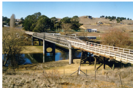
Solutions beyond the limits of timber beam bridges, left, timber trusses on concrete piers over the Clarence River at Tabulam, right, iron lattice trusses on cylindrical iron piers over the Snowy River at Dalgetty.