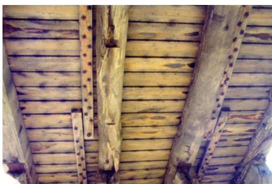
First layer of cross planks on the girders