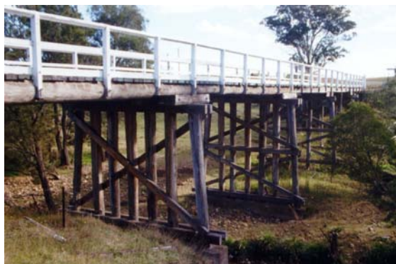
The 1894 timber beam road bridge