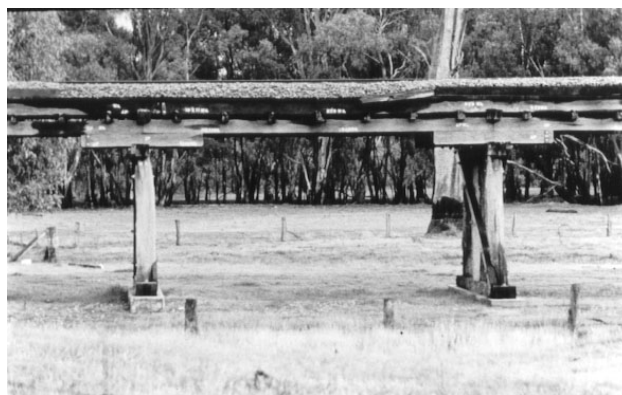
Typical timber beam railway bridge

The growth of the settlement of Sydney and the later expansion of settlement west of the coastal strip, depended on the effective and economical use of roads, and later on the railways. This dependence grew from the limitations of the coastal and inland shipping and the consequent necessity for improved land communication.