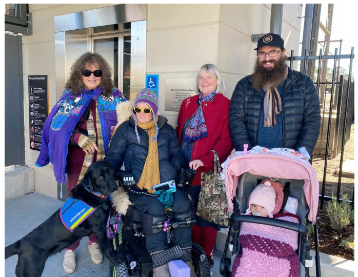
Above: Local community celebrating the opening of the Blackheath Station

Finishing work will be carried out within and around the station from 6am to 6pm on Saturday 2 September and 6am to 10pm on Sunday 3 September . Work activities including asphaltting on the station platform. Tactile installation on the platform will be completed during standard construction hours 7am to 6pm Monday to Friday and 8am to 1pm on Saturdays , due to be completed by the end of September, weather permitting.